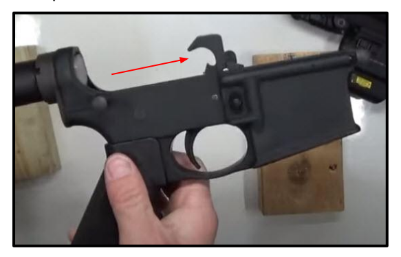
Step 6: Tap out the Hammer Hinge Pin. Keep your Punch Inserted.