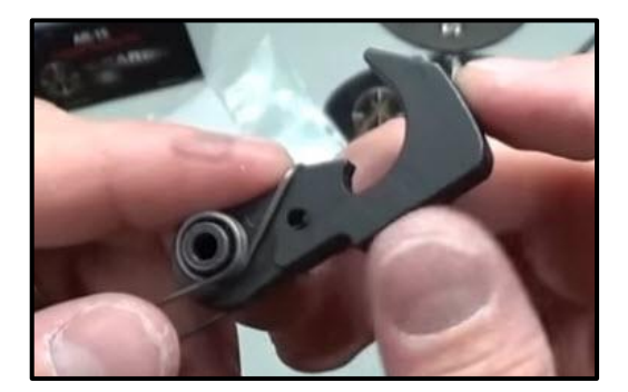
Step 10: Begin to Insert the Hammer back into the Lower.