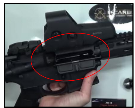
Step 2: Gather Parts and Tools needed for Installation.