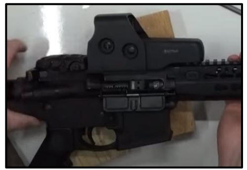
Step 14: Perform a Function Check. Test the Safety and Trigger Reset.